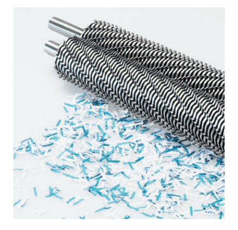
SOLID STEEL CUTTING SHAFTS Robust and durable: high-quality pa

Robust and durable: high-quality paper clip proof cutting shafts with lifetime guarantee under conditions of fair wear and tear.